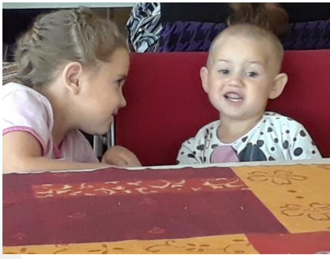
The youngest girls' table including the new arrivals.